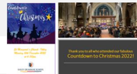
The IGS School Christmas Card 2022