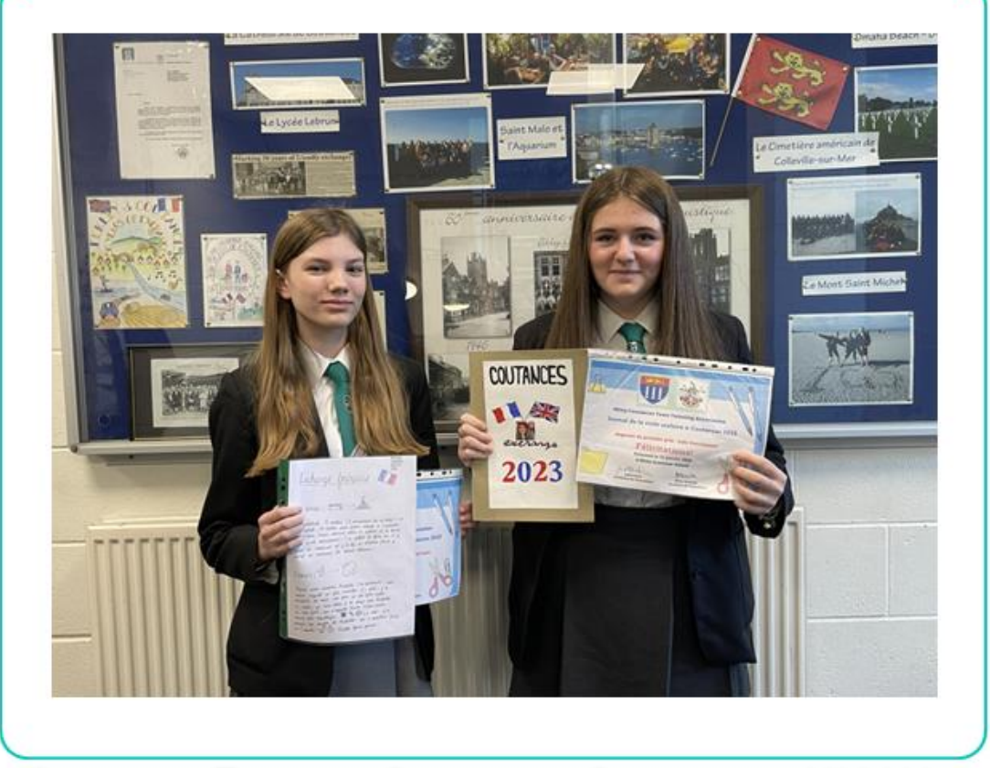
Ilkley-Coutances Twinning Committee Competition Y10 Winners!