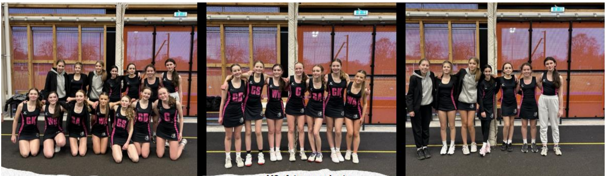
Y8 teams photo

The 7A team pictured finished runners up!