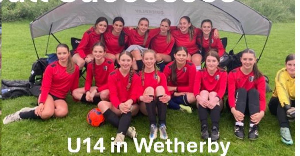
U14 in Wetherby