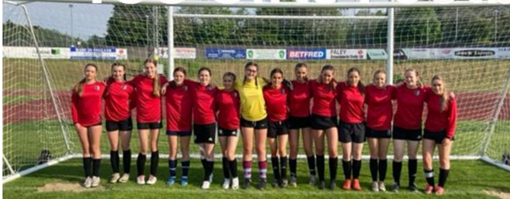
U16 at South Leeds Stadium