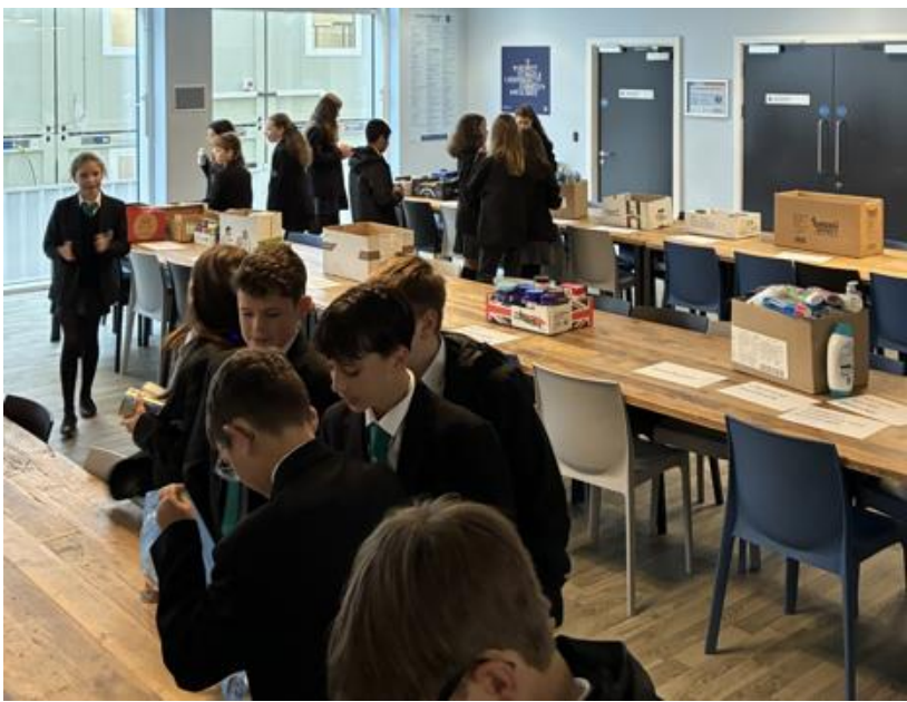
7LIR working as a team to sort donations

We helped the food bank because we wanted to give the families of Ilkley a fair share of all food and help them through tough times. We were delighted to have been asked to help with the food collecting and organising. It also links with our school values of kindness and responsibility.